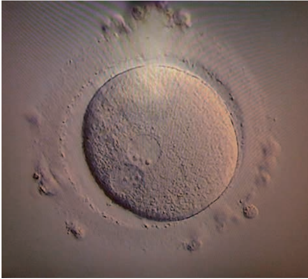
Fig. 3. — 2PN zygote from double rescue egg retrieval and IVM.

urine LH test is positive. In this case we assumed that the urine test had been positive on the evening prior to day 11. This was reinforced by the strongly positive urine LH test on the morning of day 11 and the strong peri-follicular blood velocity which was suggestive of impending ovulation. We now assume that the first attempt at egg collection which was performed 18 hours after the presumed positive urine test was performed too early but we were anxious to avoid follicular rupture before the attempt was made. Two factors influenced the decision to repeat the OR procedure. Firstly granulosa cells had been identified in the aspirate which indicated the likelihood of a cumulus being present but adherent to the wall of the follicle. The second was the strong peri-follicular flow which had an even higher velocity to that found the previous day. The implication from this was that angiogenesis was still continuing and the prospects of obtaining an oocyte on repeat OR was reasonably good. Peri-follicular velocity is directly correlated with oocyte retrieval and the quality of oocyte (Nargund et al., 1996). In this case, the patient was warned that if the follicle had filled in with blood clot then no attempt would be made but fortunately the appearance of