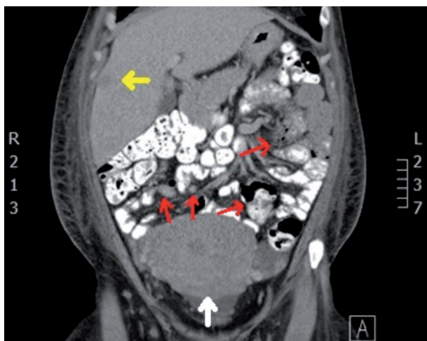
Fig. 1. — Abdominal CT scan: frontal section. Voluminous uterus (white arrow), liver metastasis (between lobe 5 and 8, yellow arrow) and mesenteric metastasis (red arrows).

Initial therapy consisted of ketoconazole as suppression of cortisol production, together with one (empirical) gift of somatostatin, perindopril as antihypertensive drug, and low molecular weight heparins in preventive dosage for the elevated risk of thrombosis. In search of the ectopic ACTH production locus, CT scan revealed a voluminous pelvic tumour widely disseminated to liver and peritoneum with multiple retroperitoneal adenopathies (Fig.1). Multiple sub-centimetric pleural noduli were seen in the posterior upper right lung lobe.