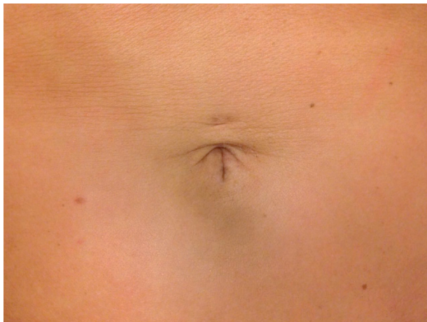
Fig. 4. — Postoperative umbilical scar