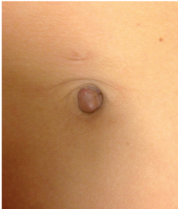
Fig. 1. — A superficial hyperpigmented dark reddish to violaceous nodule, located in the umbilicus of approximately 1 cm.

Physical examination revealed a superficial hyperpigmented dark reddish to violaceous nodule, located in the umbilicus of approximately 1 cm (Fig. 1). The nodule was not painful at palpation, was irreducible by gentle pressure and the patient stated that its size underwent periodic changes. Ultrasound (US) of the abdominal wall showed a superficial nodule of 1.15 x 1.07 cm, with no invasion of the abdominal fascia (Fig. 2). No increased angiogenesis was seen. Although a definitive diagnosis could not be obtained, under the presumptive diagnosis of cutaneous umbilical endometriosis, a local