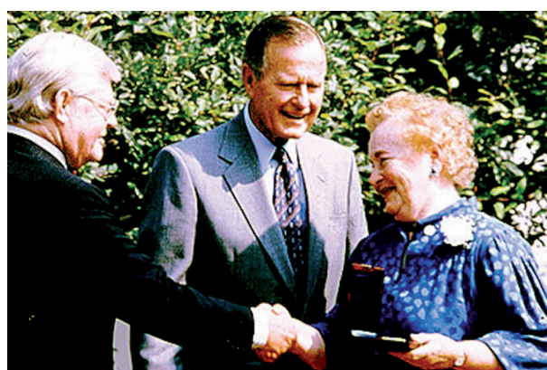
Fig. 10. — Gertrude Elion receives the national Medal of Science from President George Bush

from President George Bush. The same year, she was also included in the "National Inventors Hall of Fame" for her discovery of 6-mercaptopurine. She would be the first woman ever to have the honour of appearing in this impressive row of scholars.