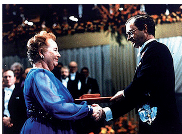
Fig. 9. — Elion receiver the Nobel Prize from Karl XVI Gustaf, King of Sweden