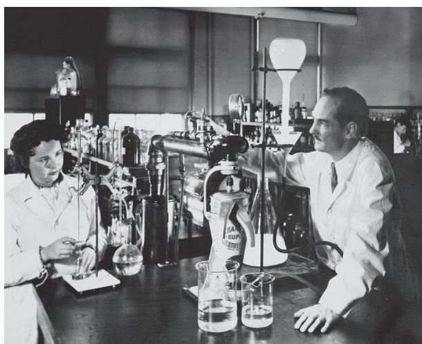
Fig. 4. — George Hitchings and Gertrude Ellion 1948

with shared sorrow; although he had graduated with Summa cum Laude and felicitations, he didn't find a job right away either. To make matters worse, he was diagnosed with a cardiac disorder during a routine medical examination. "You mustn't love me, Gertie" he wrote in despair, "I'm not a full man." Another blow for Gertrude. But it became a second turning point. In her next letter, she even showed