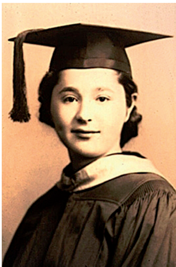
Fig. 2. — Gertrude Elion: College graduate at age 19