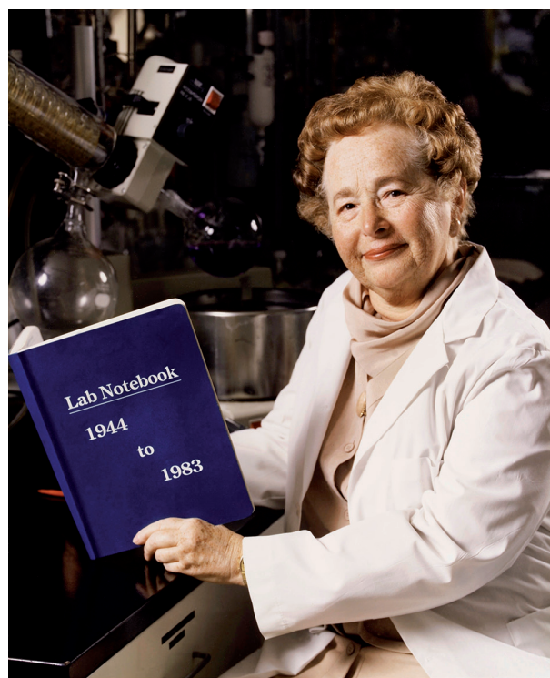
Fig. 7. — Elion's Lab notebook

This reasoning turned out to be brilliant. It went diametrically against the trial-and-error principle, used by former scientists looking for new drugs. At random, they would test thousands of chemicals and plant extracts, until one by chance appeared