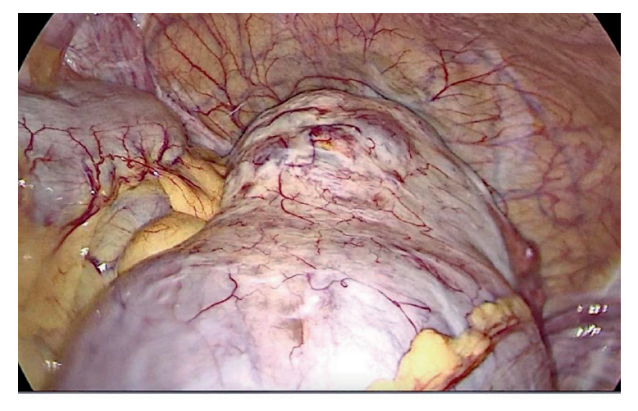
Figure 1: The left ovarian mass obliteration of the pelvic cavity.

The resident physician started by cutting the ovarian cortex and dissecting the cystic wall. Excessive bleeding from the ovarian cortex complicated the cyst stripping and therefore it was not an easy step (Figure 2). We then decided to perform a total adnexectomy for the right ovary, considering the age of the patient and the emerging technical difficulty of the overall procedure. We subsequently proceeded to explore the small cyst of the left ovary. To our surprise, we could not find it at the fossa ovarica; instead, the ovary was totally detached and found in the Douglas pouch (Figure 3). When we dissected the detached mass, the content was consistent with a dermoid cyst (Figure 4). Both adnexa were then removed using an endobag, and the tissue type of both cysts was confirmed with histopathology examination.