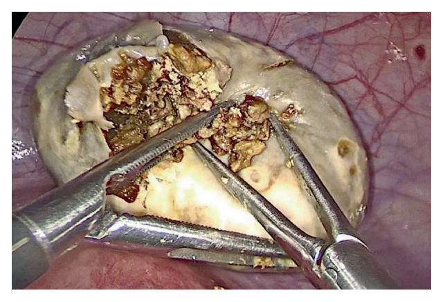
Figure 3: The floating autoamputated left ovary in the pouch of Douglas.