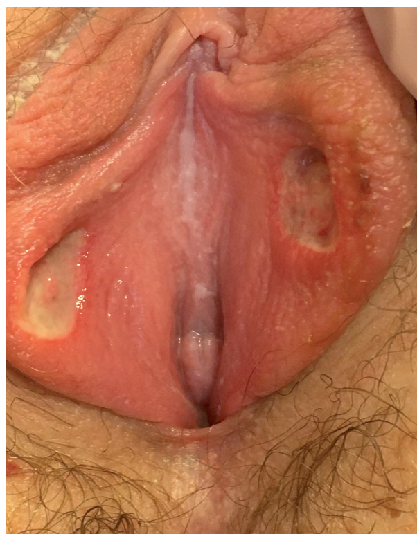
Figure 1: Symmetric ulcerations of inner labia minor known as « kissing lesions », two deep, centimetric and fibrinous ulcerations.

Intense pain caused stress for both the adolescent and her mother. Nevertheless, the patient didn't present other clinical, extra-genital signs (no neurologic, cutaneous, ocular or gastrointestinal symptoms).