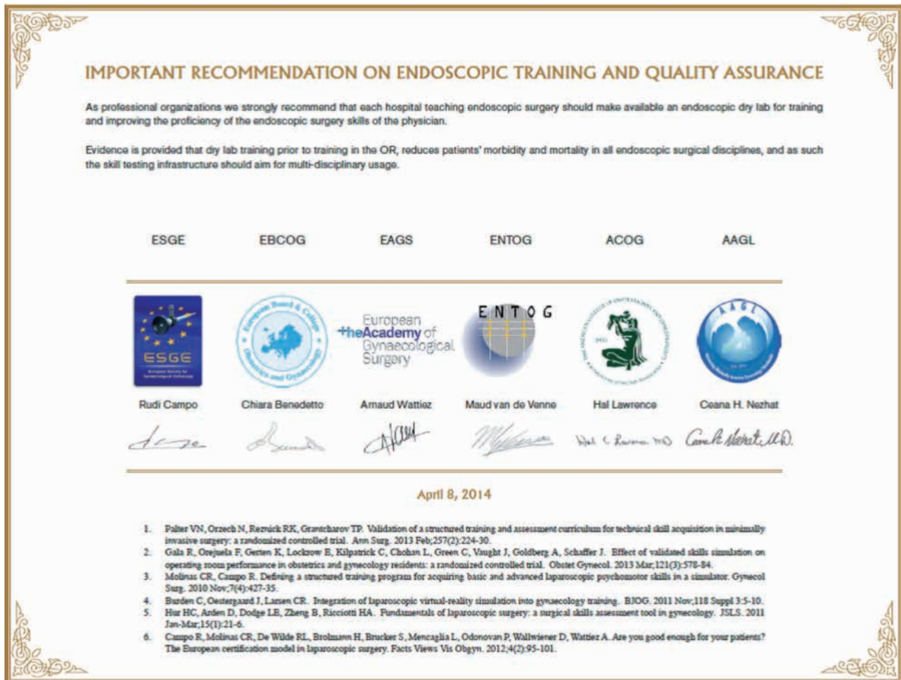
Fig. 1. — Joint recommendation on endoscopic training and quality assurance

taught also outside of the operating theatre. Based on the newest clinical and scientific evidence, the European Society of Gynaecological Endoscopy (ESGE) together with the leading European and American professional organizations have recommended in a joint statement that every hospital should provide dry lab endoscopic training and testing as a means to enhance the quality of patient care (Gala et al., 2010; Campo et al., 2010, 2012b; Burden et al., 2011; Hur et al., 2011; Palter et al., 2013) (Fig. 1).