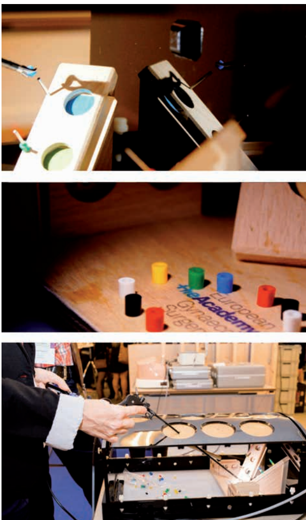
Fig. 3. — LASTT training and testing method

requirements for the diploma of the corresponding level (Fig. 2).