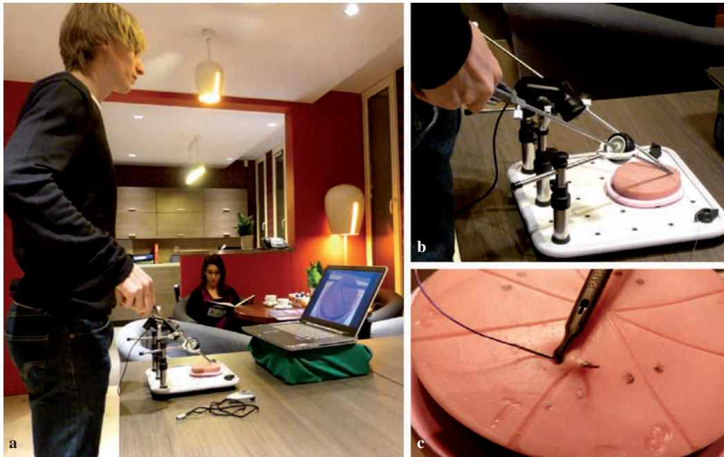
Fig. 4. — “E-Knot “. The easy home trainer a. Student training suturing skills at home. b. E-Knot with camera connected to notebook. c. Suturing pad with 8 different stitching directions.