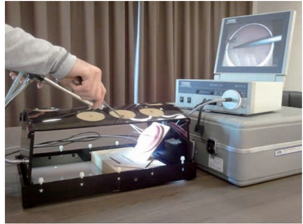
Fig. 3. — The Suturing and knot tying Training and Testing model (SUTT).