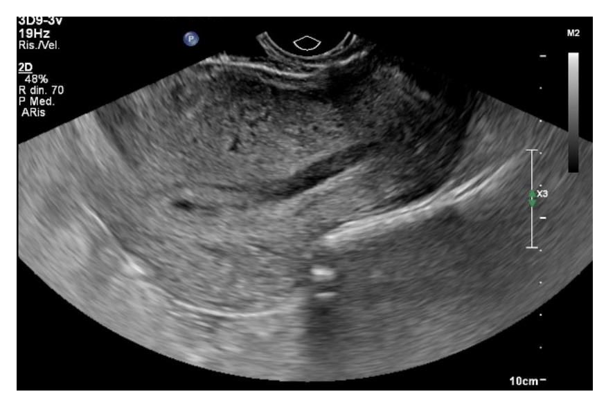
Figure 1: Ultrasound scan in the very early weeks of pregnancy, showing a thickened anterior wall with small anechogenic areas.

The patient's surgical history reported a previous hysteroscopic metroplasty, performed in 2021 for a septate uterus. She had also had a previous first trimester miscarriage because of a blighted ovum and the current pregnancy was achieved by IVF. During the first trimester of pregnancy, there was US suspicion of an arteriovenous malformation (AVM) of the anterior wall of the uterus and cervix (Figures 1 and 2) and natural progesterone therapy was prescribed. US in the very early weeks of pregnancy, showed a thickened anterior wall with small anechogenic areas, while that performed at 19 weeks of gestation, showed a diffusely thickened myometrium with larger anechogenic areas (Swiss cheese appearance). However, when the patient presented to the emergency department a few weeks later, an office US was performed that showed a live fetus in a severely altered uterus, mainly due to increased size, symmetrically in both walls, with the presence of large anechogenic spaces within all myometrial walls and turbulent flow on power-Doppler. Despite prompt care to