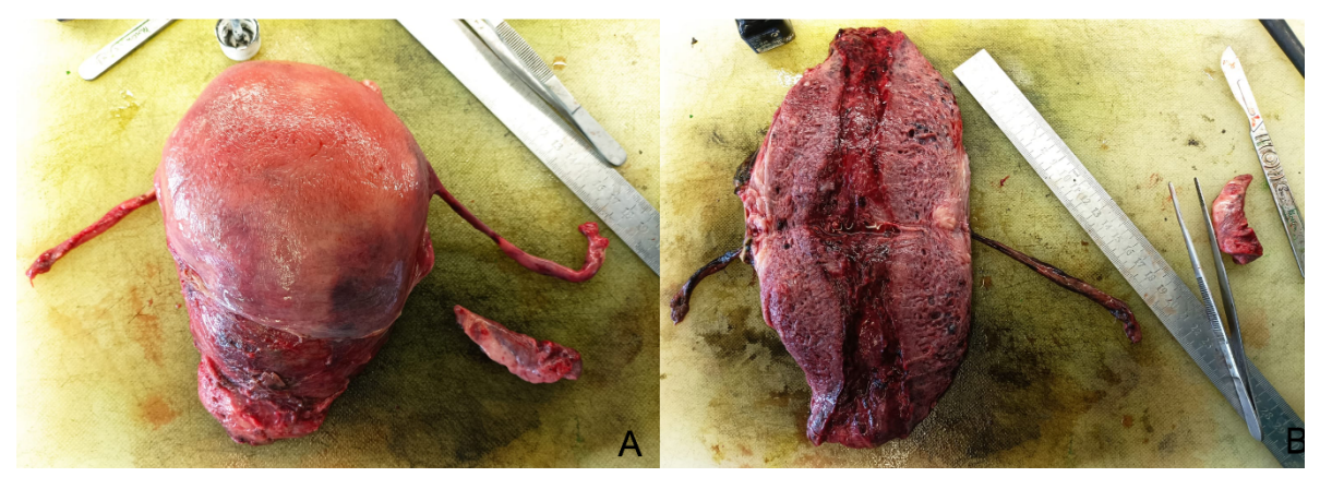
Figure 4: Anatomical detail of cavernous haemangioma. A. Macroscopic view of total hysterectomy specimen. B. Sectioned uterus; notice the thickened myometrium with a spongious appearance.