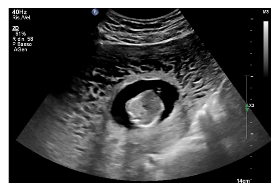
Figure 2: Ultrasound scan at 19 weeks of gestation showing diffusely thickened myometrium with anechogenic areas of larger size (Swiss-cheese appearance).

hemodynamically stabilise the patient, a few hours after admission, fetal heart rate (FHR) termination was found and consequently the pregnancy resulted in a second-trimester miscarriage. After the delivery, due to profuse bleeding, surgical evacuation with dilatation and curettage (D&C) under US guidance was performed. Bleeding persisted and intravenous Oxytocin 5 IU plus intramuscular Methylergometrine 500 mcg and finally Misoprostol 1 mg (5 tablets of 200 mcg) rectally were administered sequentially as uterotonic substances. Nevertheless, because of persistent severe bleeding, a haemostatic Bakri Balloon, filled with 150 cc of saline water, was inserted. Three hours after the procedure, the patient presented with a pale face and profuse sweating, with vital signs tending to instability. Vital parameters recorded were as follows: blood pressure 70/40 mmHg, heart rate 130 bpm, oxygen saturation 98%. Haemoglobin and haematocrit were 6 g/dl and 17,3% respectively (hemoglobin on admission: 10 g/dl). Two units of concentrated haematins and two units of plasma were transfused, in addition to intravenous infusion of electrolytes and tranexamic acid. Twenty-four hours after the procedure, the balloon was removed, and the persistence of severe vaginal bleeding was noted. US scan revealed a further increase in the size of the uterus, which reached the height of the umbilicus, with a sponge-like appearance, and several clots within the cavity.