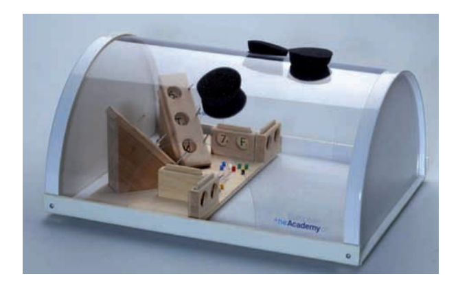
Fig. 1. — Training box for laparoscopic surgery with the LASTT wooden model.