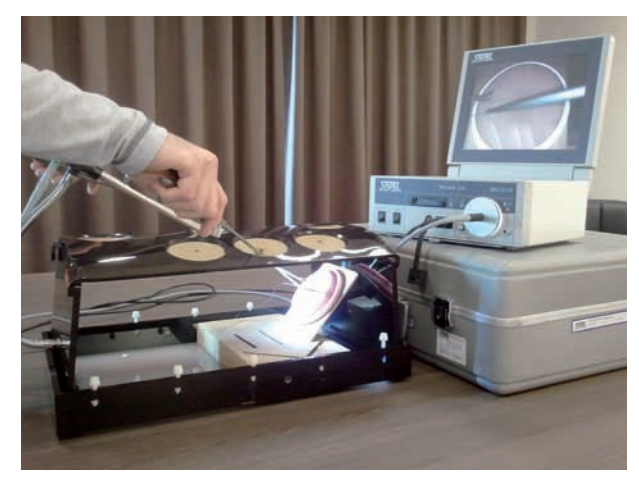
Fig. 3. — The Suturing and knot tying Training and Testing model (SUTT).

18-24 month (unpublished observations). It seems that we are dealing with skills like biking, piano playing or gaming: once you know how to do it, you keep the ability.