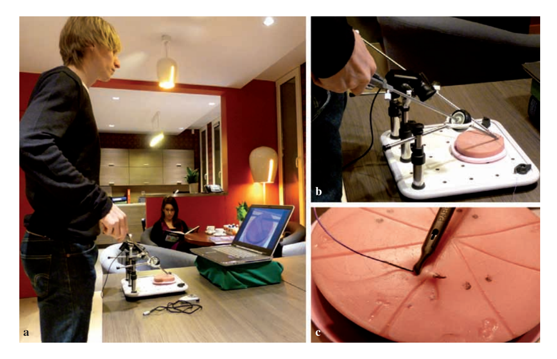
Fig. 4. — "E-Knot". The easy home trainer a. Student training suturing skills at home. b. E-Knot with camera connected to notebook.